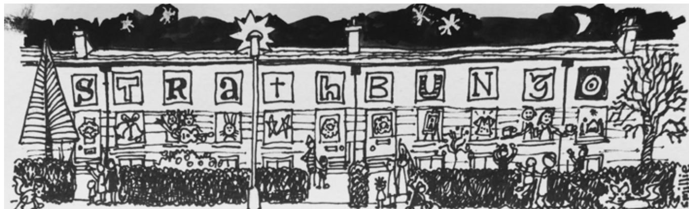
Drawing by Craig Smille

Excitement is growing for the first-ever Strathbungo Window Wanderland, with more local folk going 'on the map' for creating a night of imagination and fun.