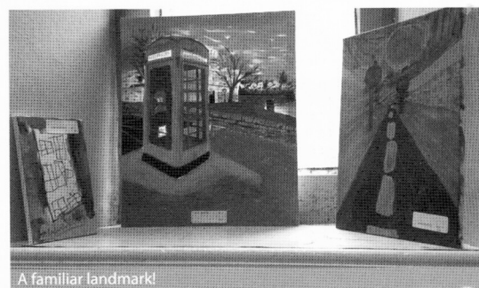
A familiar landmark!

Any thoughts on next year's theme? Send your ideas to: chair@strathbungo.com