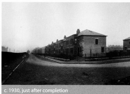
c. 1930, just after completion

If you have any photos to share, we will scan them and return them to you safely. Just let us know at: info@strathbungo.co.uk