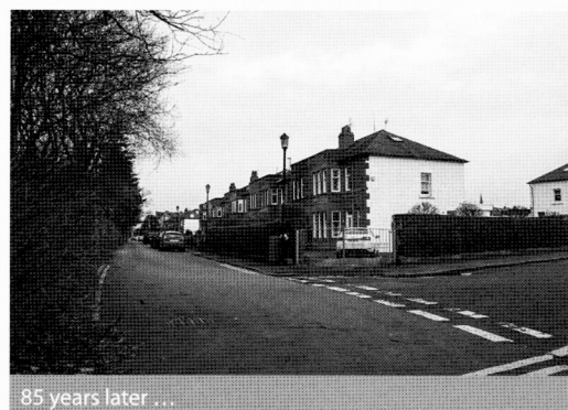
85 years later ...