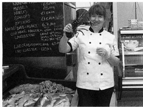
Loch Fyne Shellfish pringhill Gardens