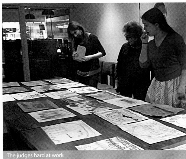
The judges hard at work

You can see all of their choices for the top prizes at www.bungoblog.com and the original artwork on the walls of Tapa, Gusto & Relish, Mulberry Street and Little Botanica .