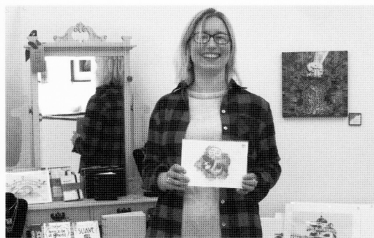
Maker's Workshop 912 Pollokshaws Road