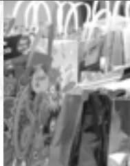
Spring Fling Children's Art Contest Winners