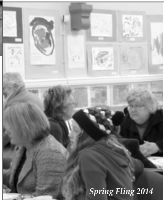
Spring Fling 2014

Back Lanes going strong. The Strathbungo Society is not sponsored by the city council, and we have no source of regular funding. We're just a group of people from the neighbourhood who volunteer our time and resources. We need all the help we can get to keep Bungo in the Back Lanes running smoothly and to raise funds for future events. Thanks in advance for anything you can do to help!