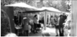
Bungo in the Back Lanes