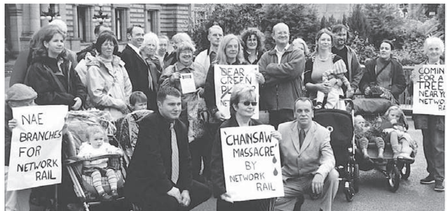
Campaigners at the City Chambers, 16th Sept