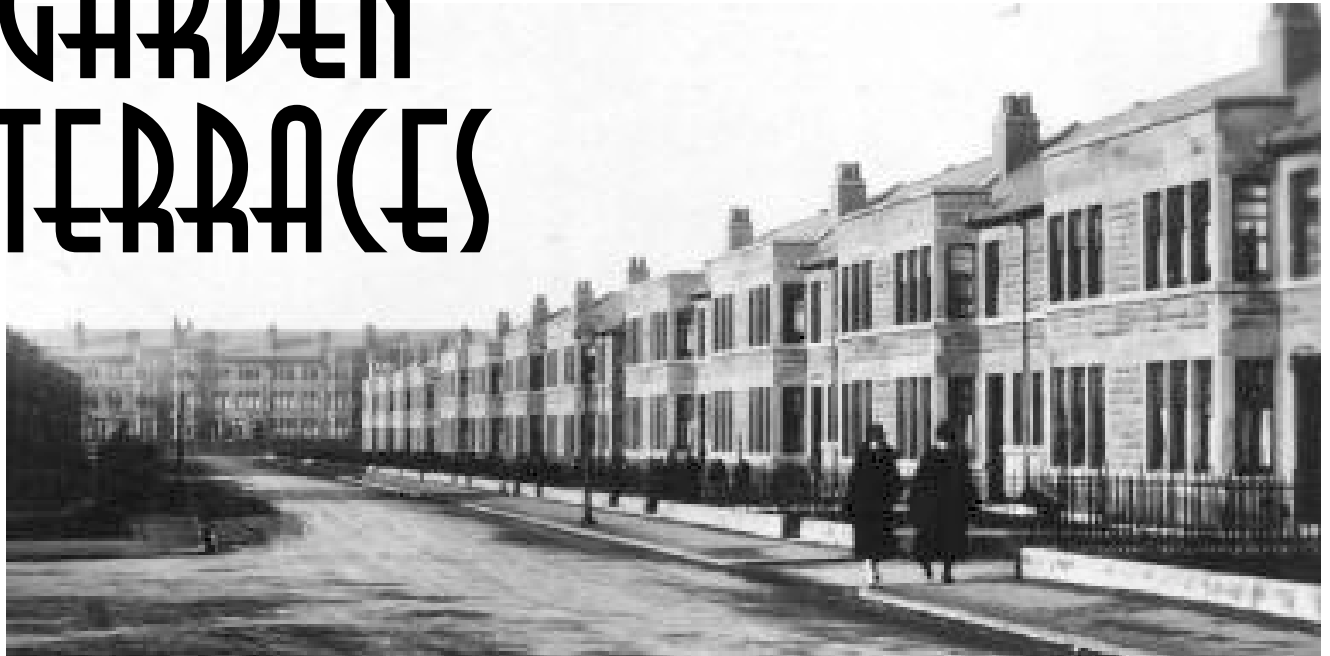
Thorncliffe Gardens c. 1930 and nary a car in sight! Planning officers have expressed concerns about alterations to windows and rear elevations in the garden terraces.