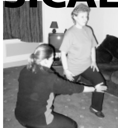
Practising for the Royal Garden Party.