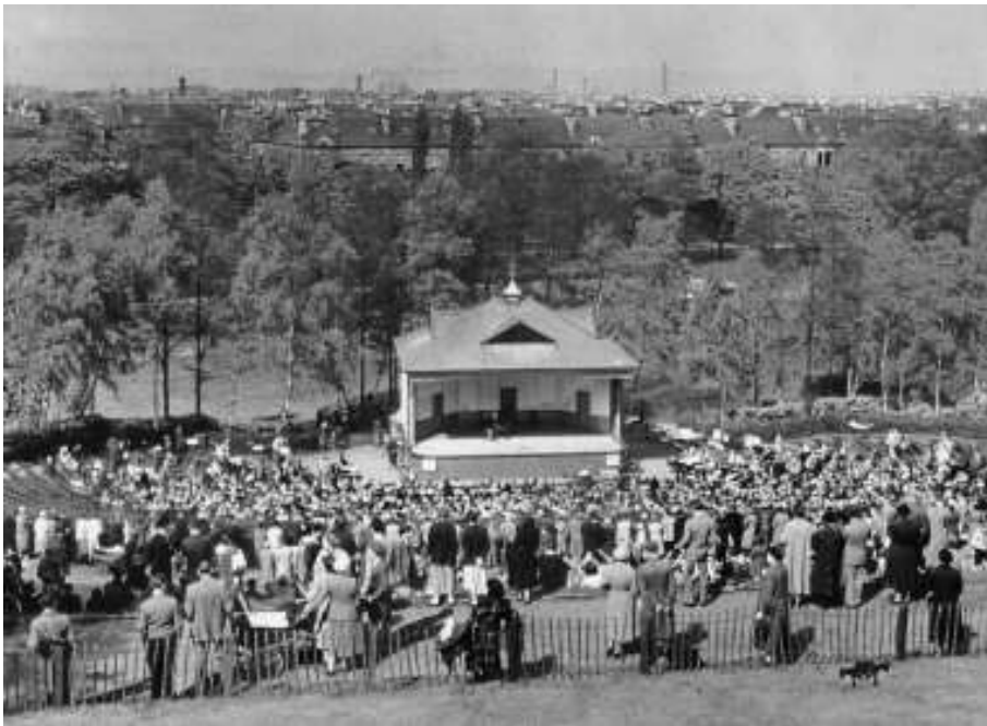
Queens Park bandstand in 1955 ... but what lies ahead for this landmark site?