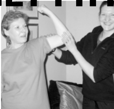
What a champion!