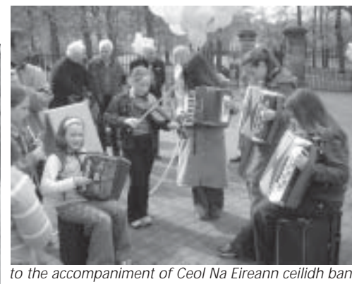
Clowning around . . .