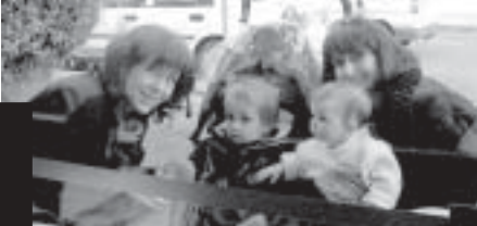
Come on in . . .