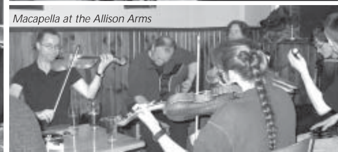
Macapella at the Allison Arms