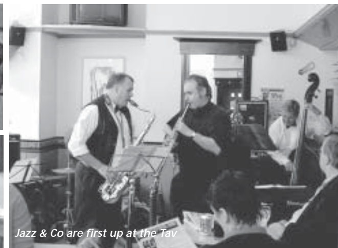
Jazz & Co are first up at the Tav