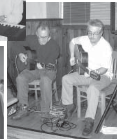
Swing Guitars put on a rousing acoustic set