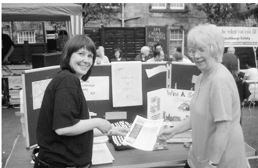
The Strathbungo News is launched at 'Bungo in the Back Lanes'