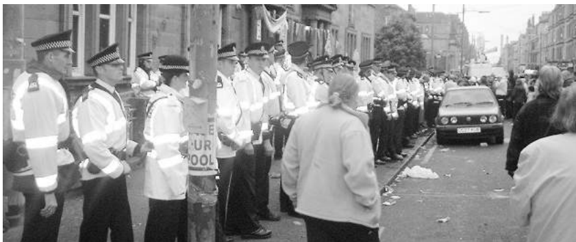
Calder Street on Wednesday 8th August