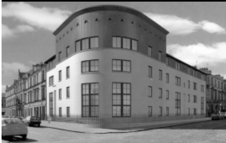
The shape of things to come ... architect's drawing of the new building at the corner of March Street and Nithsdale Drive.

ATTENTION: Residents of Nithsdale Rd, Nithsdale St & March St