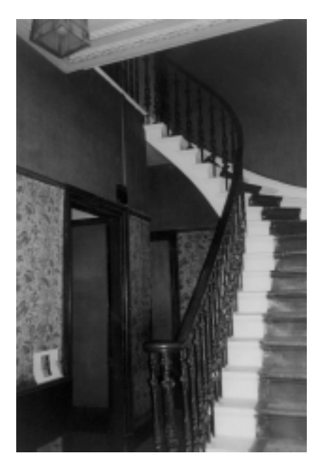
The relatively simple ceiling rose and egg & dart cornices feature in other houses in the street - the light shade is early 20th century.