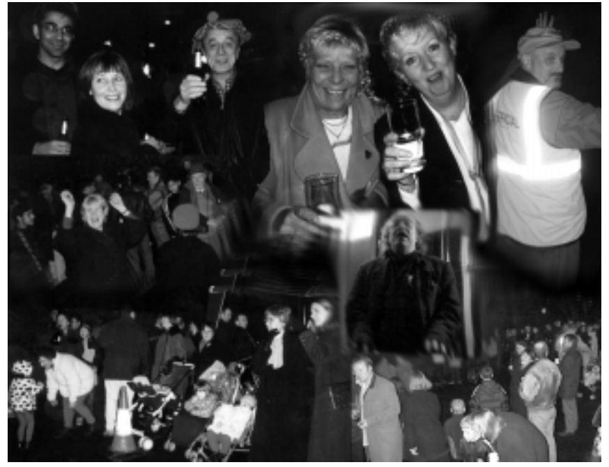
Just a few of the revellers at last year's Bungo at the Bells celebration

TALK BACK your chance to have your say . . .