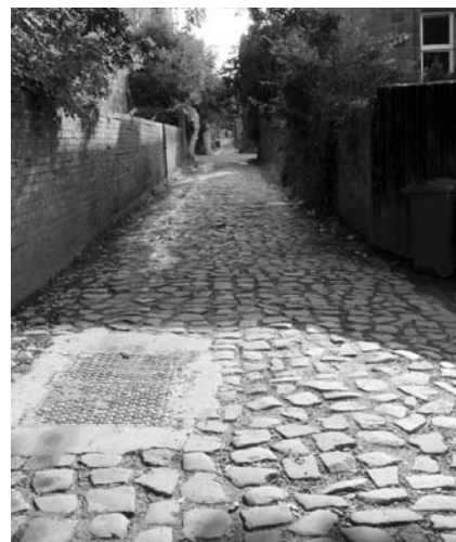
The back lanes have been restored and are looking better.

If you're planning to set up a stall in your garden or would like to reserve a spot to set one up elsewhere, please get in touch. We are still looking for a space for the children's garden, which will be organised by the folks at Merry-Go-Round, and volunteers for set-up and clean-up are needed, as well.