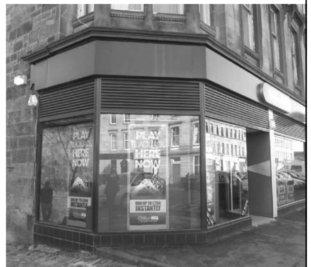
WILLIAM HILL, 2013