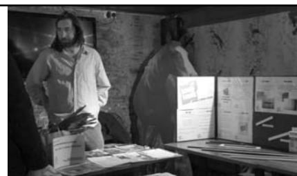
Locavore's Reuben Chesters

Inside, non-profits Southseeds and Locavore had tables with information on their projects: gardening and energy conservation for South Seeds and locally produced food for Locavore. Both organisations are based on the south side and include Strathbungo in their service area.