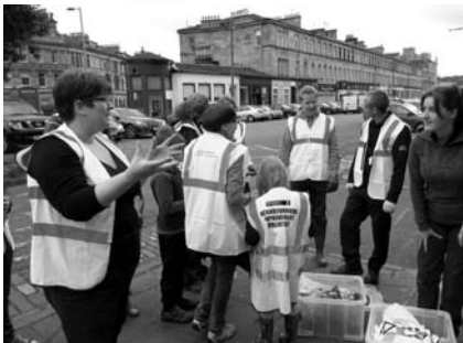
Volunteers get ready to hit the pavement at the last Brighter Bungo