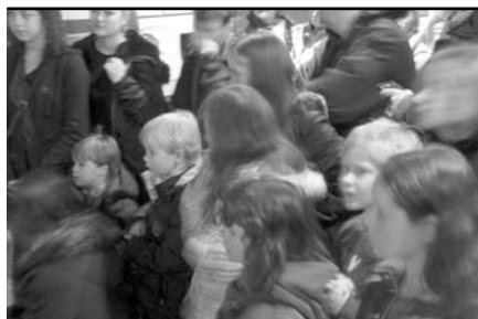
Young artists