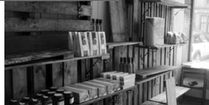
Locavore's new Nithdale shop and the contents of a typical early spring £10 veg bag.