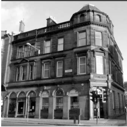
The Linen Bank Building at 697 Pollokshaws Rd./ 5 Torrisdale St.