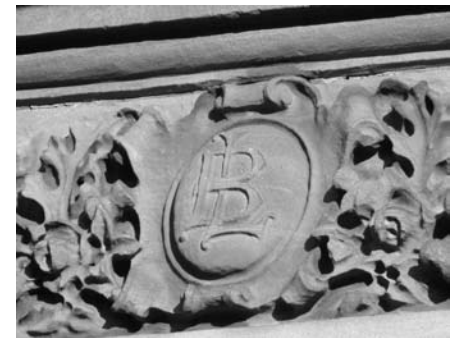
LB = Linen Bank

Back in the 1700s, it was difficult for Glasgow businesses to access capital. All the banks were in Edinburgh, and they only worked with people they knew. The Linen Bank started as a linen manufacturing interest, and it provided financial services to weavers. It was officially recognised as a bank in 1771, and it used its textile industry network to establish branches all over Scotland in the nineteenth century., making banking services accessible to everyone, even families and individuals who weren't wealthy.