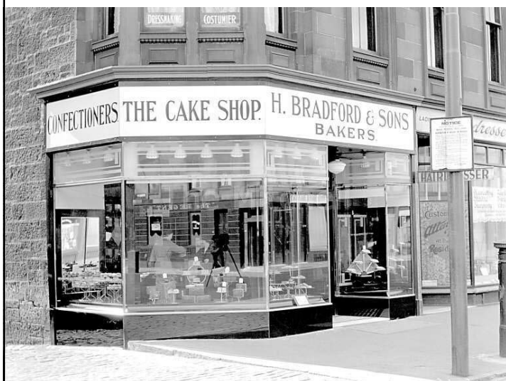
BRADFORD'S BAKERY, 1935