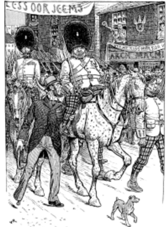
THE MARCH OF THE STRATHBUNGO FUSILIERS.

touches upon - for example, the need for a Greater Glasgow - are still beyond the wit of government to this day. For more information, see the excellent Imagine City: Glasgow in Fiction by Moira Burgess, Argyll Publishing £12.99. And thanks to Aileen Smart for permission to print the Jeems Kaye cartoon from her equally excellent Villages of Glasgow .